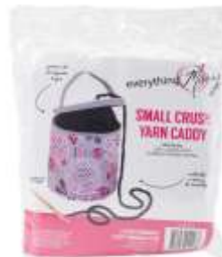
ACCYARNCADDY $12.00 Yarn Caddy