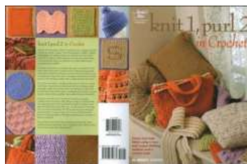
879543 Knit 1, Purl 2 in Crochet $25.10 * Heavy