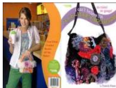
LA4475 I Can't Believe I'm Free Form Crochet $22.00