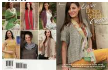
871382 Learn Drop Stitch Crochet $16.25