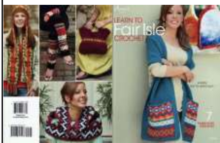
871230 Learn to Fair Isle Crochet $12.50