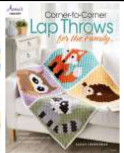
871626 Corner-to-Corner Lap Throws $17.50