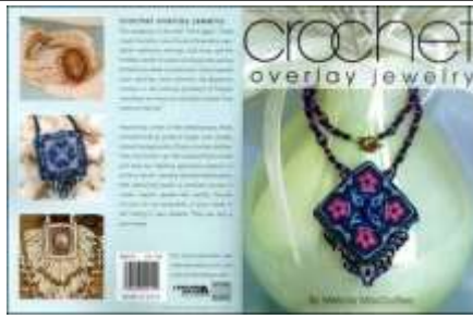
LA4014 Crochet Overlay Jewelry $26.20 * Heavy