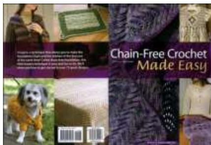
104037 Chain Free Crochet made Easy $35.70 ** Very Heavy