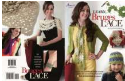
871206 Learn Bruges Lace $14.20 * Heavy