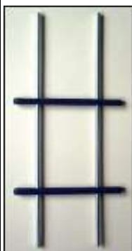
HOOKHAIRPINADJ Bates Adjustable Hairpin Lace Loom $9.80