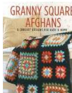
LA5811 Granny Square Afghans $12.50