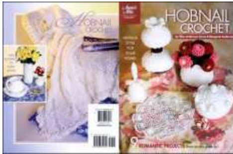
877514 Hobnail Crochet $14.20