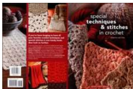
104035 Special Techniques & Stitches in Crochet $35.60 ** Very Heavy