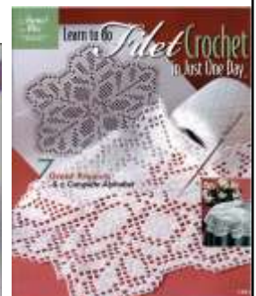
ASN1281 Learn to Filet Crochet in JOD $19.40