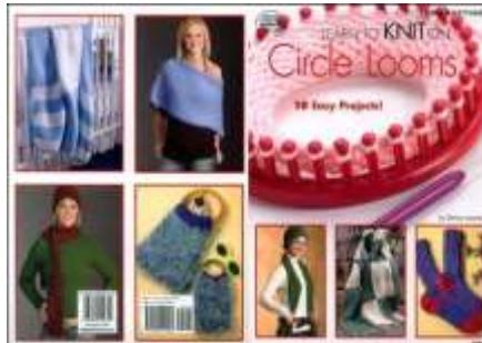
ASN1405 Learn to Knit on Circular Looms $16.95