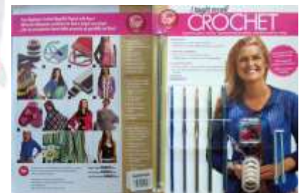
HOOKSETBEGIN $29.50 I Taught myself to Crochet