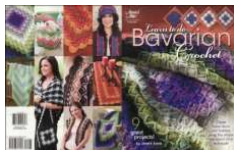
871045 Learn to Bavarian Crochet $25.60