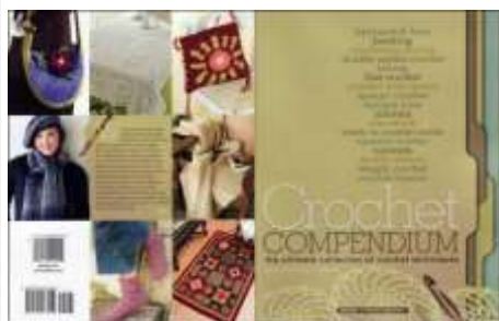
871130 Crochet Compendium $26.95 ** Very Heavy