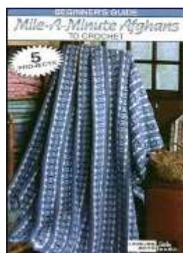
LA75010 Beg Guide Mile a Minute Afghans $8.50