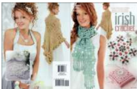
871106 Irish Crochet $13.95