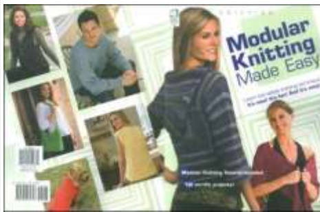
121033 Modular Knitting Made Easy $16.70