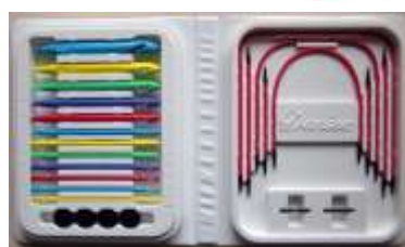
HOOKSETDENISE $98.50 Interchangeable Hook set