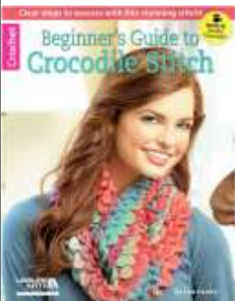
LA6377 Beginner's Guide to Crocodile Stitch $26.50