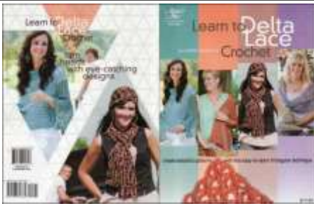
871103 Learn to Delta Lace Crochet $13.70