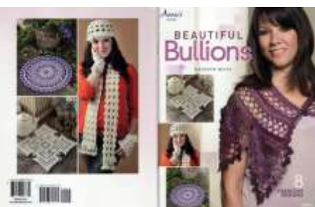
871233 Beautiful Bullions $13.80