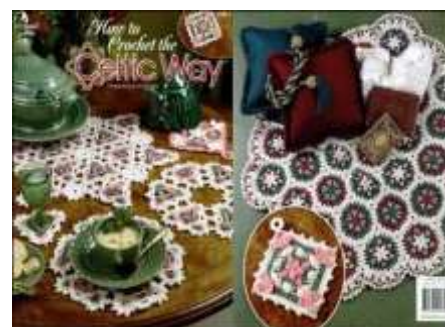
874053 How to Crochet the Celtic Way $14.30