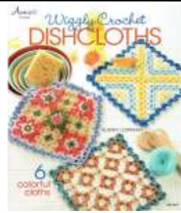
871377 Wiggly Crochet Dishcloths $ 7.50