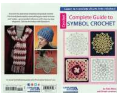
LA75475 Complete Guide to Symbol Crochet $15.95