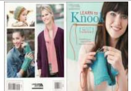
LA5776 Learn to Knook $15.30