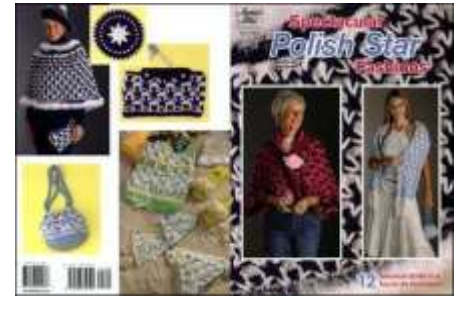
875559 Spectacular Polish Star Fashion $16.35