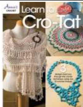
16210X Learn to Cro-Tat $20.50