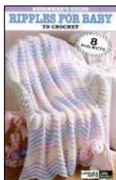
LA75011 Beg Guide to Ripples for Baby $8.30