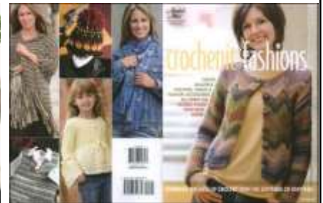
879544 Crochetnit Fashions $15.00