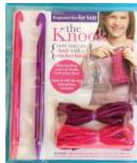
HOOKSETKIDS Knook for Kids $18.50