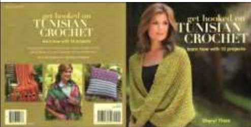
B1076 Get Hooked on Tunisian Crochet $35.95 * Heavy