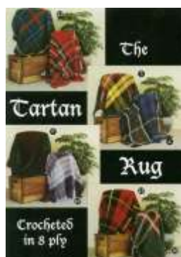
TFDISTART The Tartan Rug Book $9.50