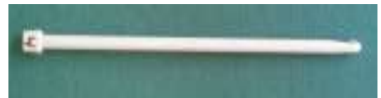
HOOKTRICOT- Tricot Hooks From 2mm ($4.75) to 12mm ($15.85)