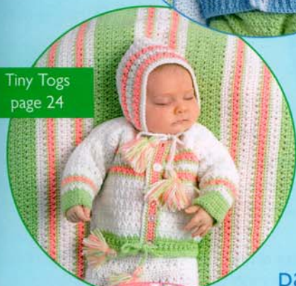
Tiny Togs page 24

Each of these stylish crochet pattern sets for Baby includes a cardigan, hat or bonnet, and booties, and gives you the choice of creating pants and a top or a one-piece romper.