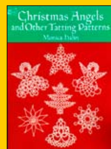
DV0763 - $13.95 Christmas Angels Tatting Patterns