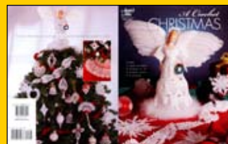
877520 - $14.60 A Crochet Christmas