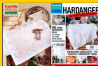
NN1082 - $24.15 Burda Hardanger E534