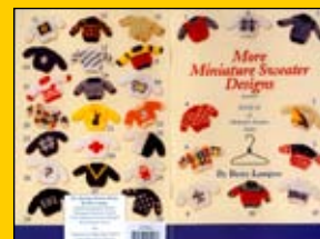
BLMS3 - $12.95 (Knit) More Miniature Sweater Designs

We also have metallic threads in #10 Maxi, #30 Klasik and 4ply Excel yarn, Madame Tricote #5 perle and 4ply Clever Country. Contact us if you need to know more. We also stock Christmas tea towels at $2.20 each.