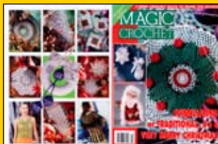
MAGMAGIC140 - $11.00 Magic Crochet Magazine

Yes if you do not start now - it will not be finished on time. We have lots of books for crochet, tatting, hardanger and knitting to get you started.