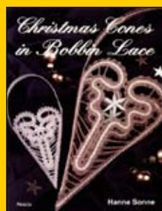
FA0951 - $37.50** + post Christmas Cones in Bobbin Lace