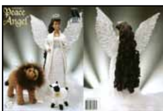
870517Z Peace Angel $10.00