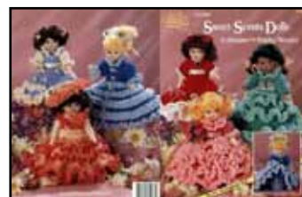
ASN1183 Sweet Scents Dolls $10.00