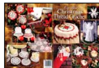
LA2941 Our Best Christmas Thread Crochet $17.10