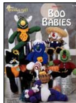
961708Z Boo Babies $10.00