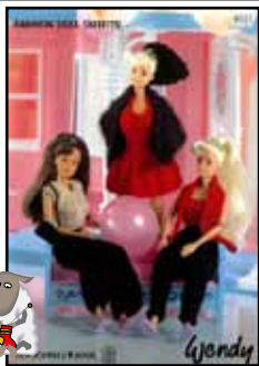
WEN4631 Fashion Doll Outfits $4.65