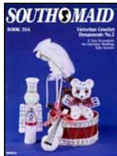
CS0204 Victorian Crochet Ornaments $7.35