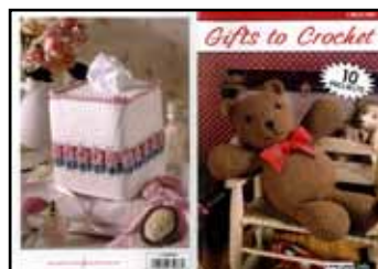
LA75036 Gifts to Crochet $8.30