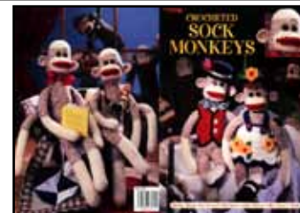
LA3130 Crocheted Sock Monkeys $9.50