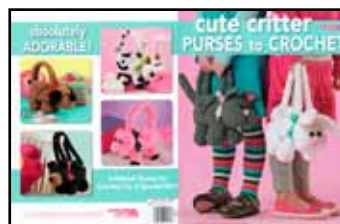
LA4160 Cute Critter Purses to Crochet $17.50