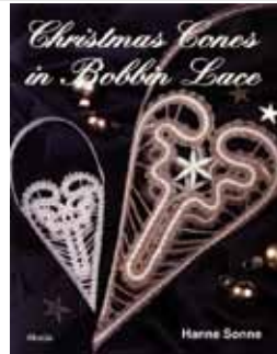
FA0951 Christmas Cones in Bobbin Lace $37.95**