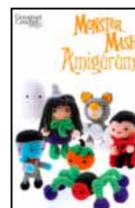
GC70108 Monster Mash Amigurumi $10.00

Extra postage may apply to books marked * or ** after the price.