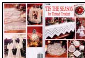
LA3152 Tis the Season for Thread Crochet $18.30