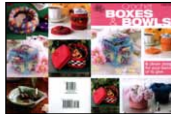
ASN1407 Crochet Boxes & Bowls $14.20