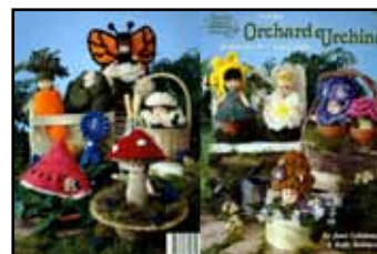
ASN1260 Orchard Urchins $12.20