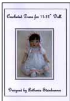
TTDSCD12 Crocheted Dress for 12" Doll #10.00