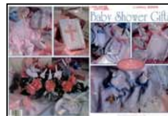
LA2828 Baby Shower Gifts $16.50