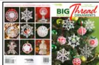
LA4795 Big Book of Thread Ornaments $42.90**