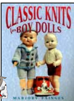
SS7178 Classic Knits for Boy Dolls $21.95*