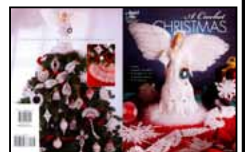
877520 A Crochet Christmas $14.60

Extra postage may apply to books marked * or ** after the price.