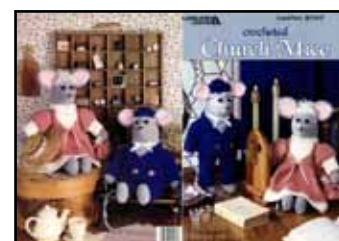
LA2147 Church Mice $10.50