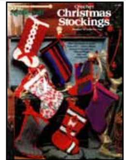
951340Z Christmas Stockings $10.00