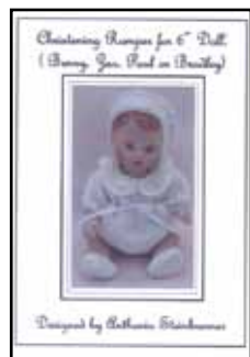
TTDSCR Christening Romper for 6" Doll $10.00