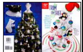
879529 Trim the Tree $14.95