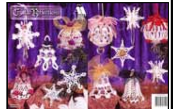
879712Z Crystal Reflections $10.00