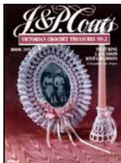
CS0202 Victorian Crochet Treasures $7.35