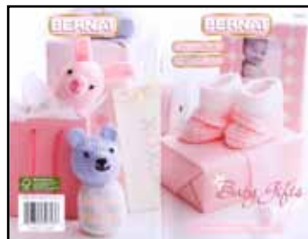
NMBER530199 Baby Gifts $7.50