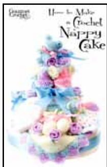
GC36107 How to Make a Crochet Nappy cake $10.00