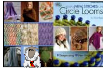
ASN1433 Learn new Stitches Circle Looms $16.95