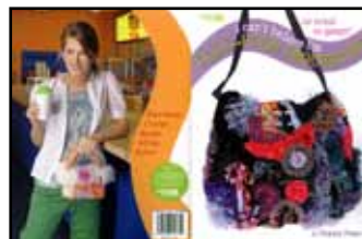
LA4474 Fun-to-Crochet Gifts $21.40