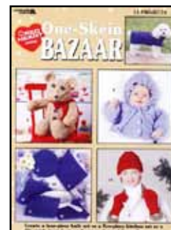
LA2954 One-Skein Bazaar $12.95