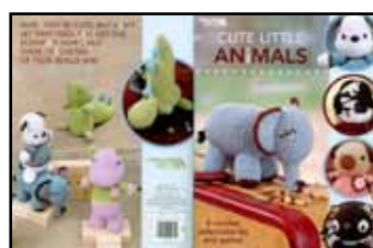
LA4271 Cute Little Animals $21.80