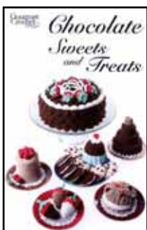
GC31107 Chocolate Sweets & Treats $10.00