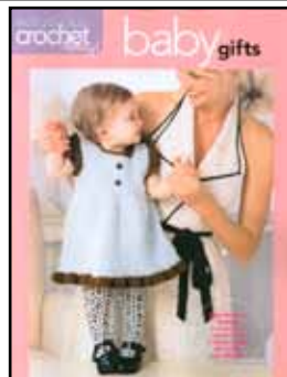
NMCC0003 Baby Gifts (Crochet Today) $18.90