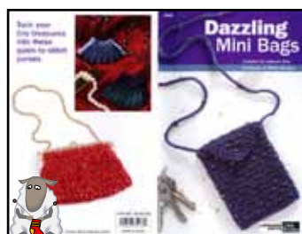
LA75136 Dazzling Mini Bags $9.30