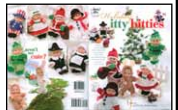
879542 Holiday Itty Bitties $15.00