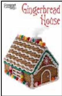
GC50107 Gingerbread House $10.00