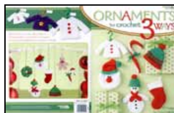
LA4241 Ornaments to Crochet 3 Ways $19.70