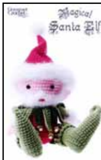
GC47107 Magical Santa Elf $10.00