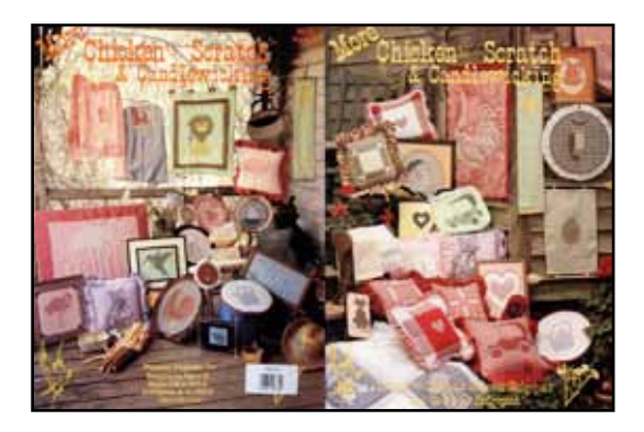
PO113 More Chicken Scratch & Candlewick $12.35