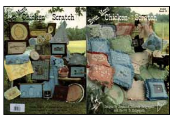
PO115 Even More Chicken Scratch $12.35

PO112 Chicken Scratch & Candlewicking $15.35