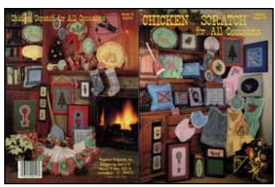
PO116 Chicken Scratch for All Occasions $12.35