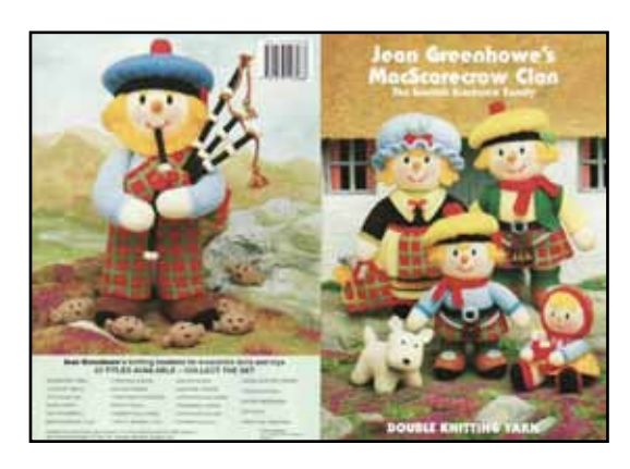
ORDER ON LINE AT www.crochetaustralia.com.au