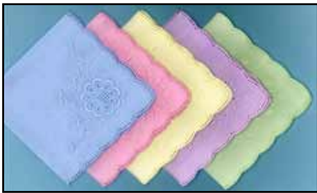
HANKCOLSCAL - Handkerchief, Coloured, scalloped edge with motif (hemstitched) blue, pink, lemon, lilac & green $4.55ea

Also available as set of 6 (blue, pink and lemon 2 of each colour) $24.50 set.