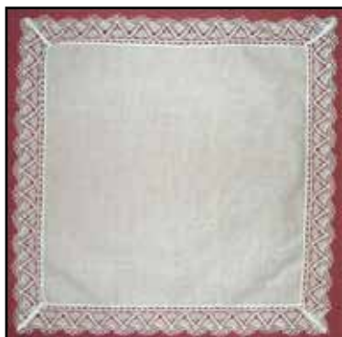
HANKPLAINLE - Handkerchief, White, laced edge $5.45ea.