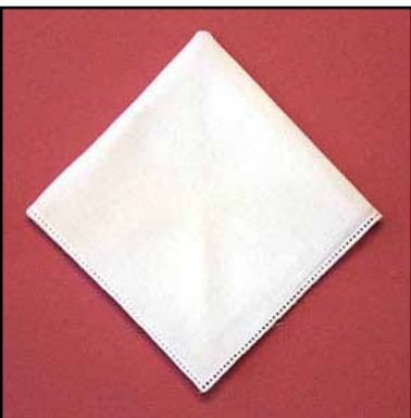
HANKPLAINSEGE - Handkerchief, White, Plain Cotton (hemstitched) $4.10ea or Set of 6 $22.00

Also available as set of 6 (blue, pink and lemon 2 of each colour) $24.50 set.