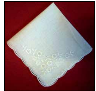
HANKSCAL - Handkerchief, White, scalloped edge with motif (hemstitched) $4.35ea or Set of 6 $23.50.