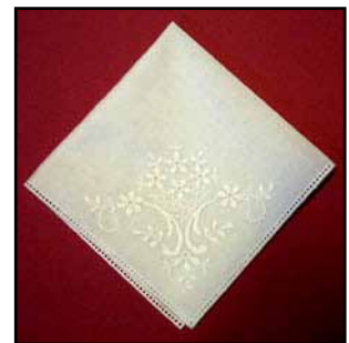
HANKSEGE - Handkerchief, White, straight edge with motif (hemstitched) $4.35ea or Set of 6 $23.50.