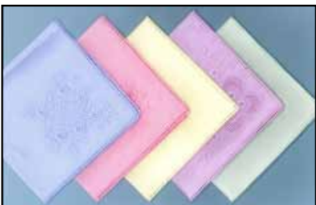
HANKCOLSEGE - Handkerchief, Coloured, straight edge with motif (hemstitched) blue, pink, lemon, lilac & green $4.55ea.

Also available as set of 6 (blue, pink and lemon 2 of each colour) $24.50 set.