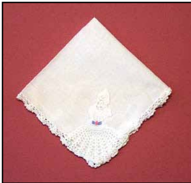
HANKLECRIN - Handkerchief, White, Crocheted Lace Edge with Crinoline Lady Motif $4.65ea or Set of 6 $25.00.

Handkerchief, Coloured, plain, straight edge (hemstitched) blue, pink, lemon, lilac and green $4.25ea; Also available as set of 5 (1 ea colour) $20.00 set.