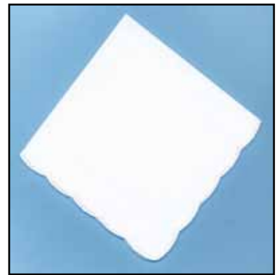
HANKPLAINSCAL - Handkerchief, White, scalloped edge (hemstitched) $4.10ea or Set of 6 $22.00.