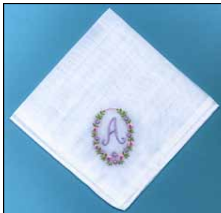
HANKMTFALPHA - Handkerchief, White, Folded edge with Alpha Motif $5.05ea