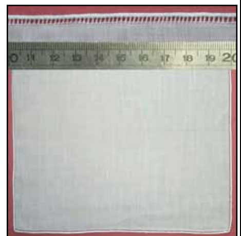
HANKLIN - Handkerchief, Linen, White, straight edge (hemstitched) $4.75ea or Set of 6 $25.65