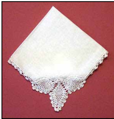
HANKLEBFLY - Handkerchief, White, Crocheted Lace Edge with Butterfly Motif $4.65ea or Set of 6 $25.00.

Also available as set of 6 (blue, pink and lemon 2 of each colour) $24.50 set.