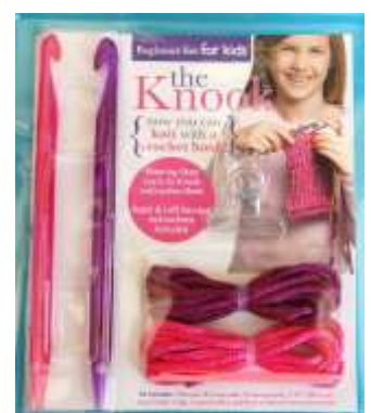
KNOOKSETKIDS set $16.50