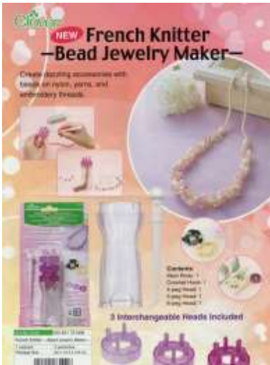
ACCBEADKNITTER French Bead Knitter $21.95