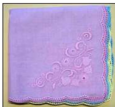
HANKMIXCOLSCAL set $24.50 WE'RE HOOKED ON CROCHET