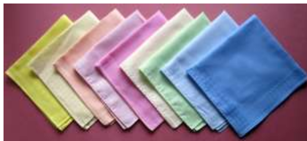
HANKWOVENCOL7 set $14.50