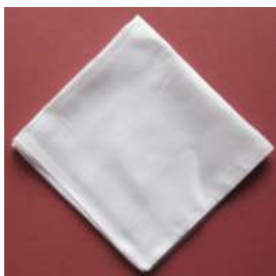
HANKWOVENPLAINR set $15.50