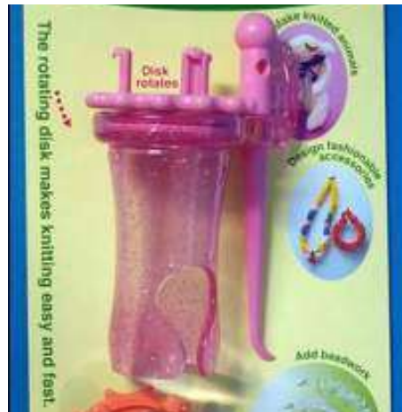
ACKKNITWONDER Wonder Knitter $13.95