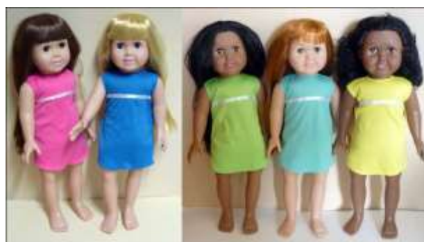
DOLLSF18 $59.50 each