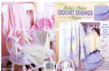
LA3485 Baby's Choice Crochet Edgings $13.95