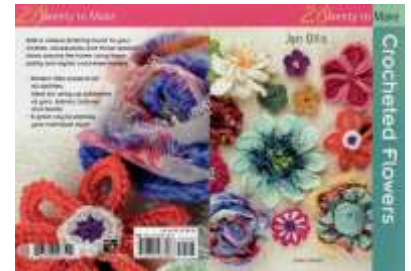
SP7066 – Crocheted Flowers 20 to Make $12.95