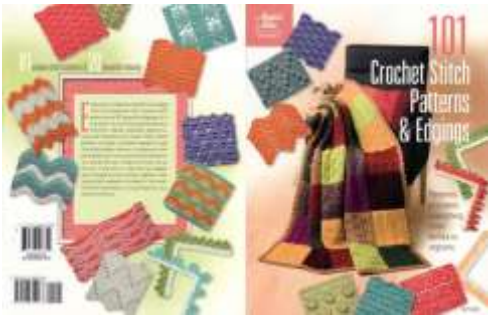
871201 101 Crochet Stitch Patterns & Edgings $29.95 **