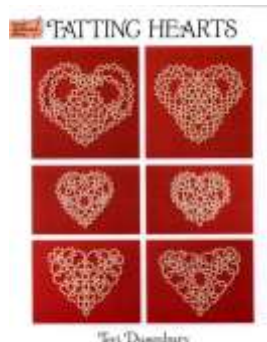
DV0713 Tatting Hearts $13.95