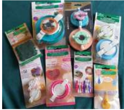
Pom-pom makers and knot templates. Price range from $6.70—$20.20