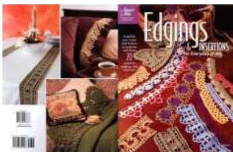
878535 Edgings & Insertions $12.95