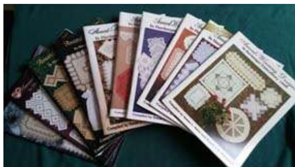
NN228—250 Award Winning Designs in Hardanger years 1999, 2003, 2004, 2005, 2006, 2008, 2009, 2010, 2011, 2012, 2013 Price range from $16.30—$30.95