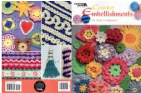
LA4419 – Crochet Embellishments $48.10 **