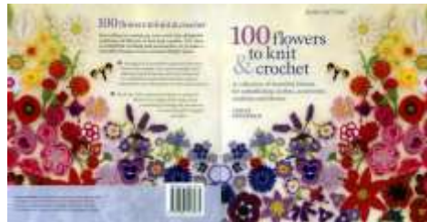
SM3975 100 Flowers to Knit & Crochet $39.95 **