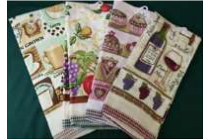
TOWELDELUXE $6.25 each