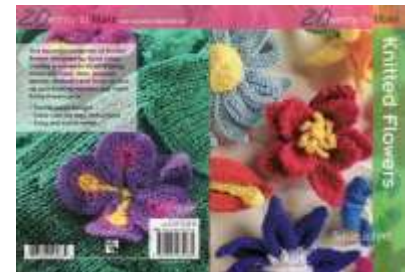
SP4935 – Knitted Flowers 20 to Make $12.95