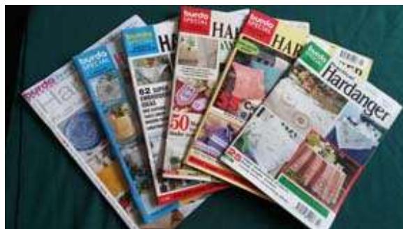
NN1072—NN1082 Burda Specials - Hardanger and pulled thread embroidery. Price range from $14.60—$24.15