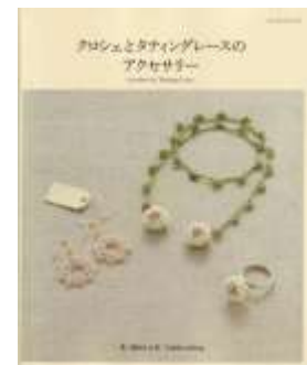
HHT373 Crochet & Tatting Lace $59.95 **