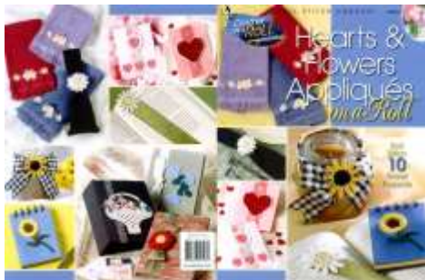
874611 Hearts & Flowers Appliques Roll $13.45