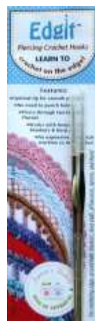
HOOKEDGEIT Set of 2 $13.10