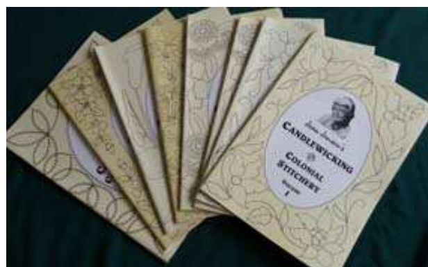
JJ01—JJ08 Candlewicking Volumes 1—8 $9.95 each