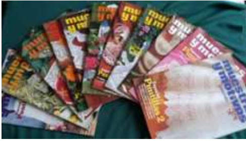
PUNTI1—17 Filet/Symbol Crochet Edgings and Insertions. $11.95 each