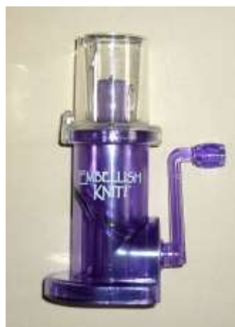
ACCEMBKNIT Embellish Knit Spool $29.95