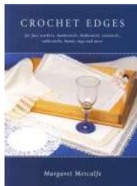
MC9316 Crochet Edges $29.95