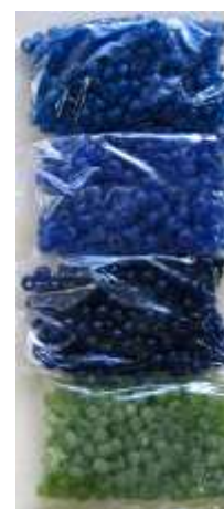
BEADGT100 —100 beads 9 colours to choose from $8.00