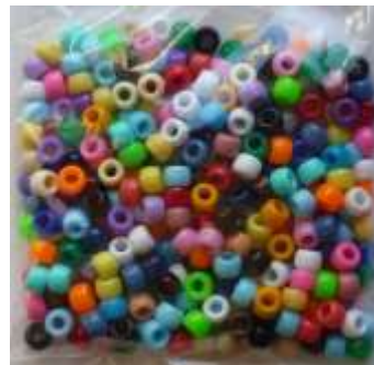
BEADPOMIX75g—260 beads $11.00