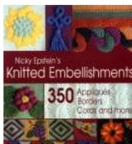
KA1039X Knitted Embellishments $51.95 **