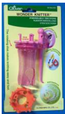
ACCKNITWONDER Clover Wonder Knitter $13.95