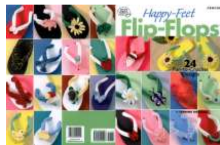
ASN1379 Happy –Feet Flip-Flops $15.35