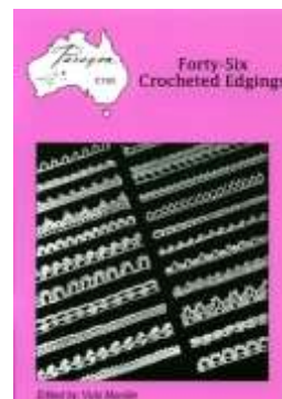
PARC103 Forty-six Crocheted Edgings $10.75