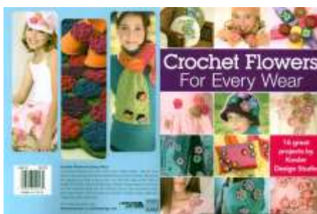
LA4013 Crochet Flowers for Every Wear $21.80