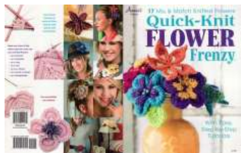
121081 Quick-Knit Flower Frenzy $13.80