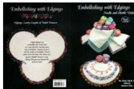
HHT360 Embellishing with Edges $22.95