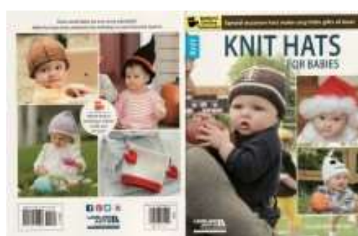
LA6192 Knit Hats for Babies $15.95