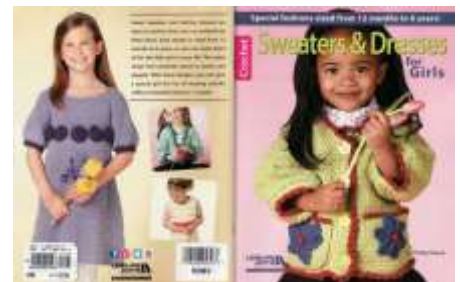
LA5303 Sweaters & Dresses for Girls $18.95