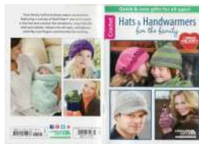
LA75488 Hats & Handwarmers for the Family $9.50