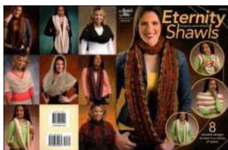
875552 Eternity Shawls $13.45