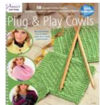
121102 Plug & Play Cowl (Knit) $22.50