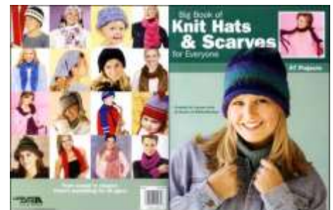
LA4484 Big Book of Knit Hats & Scarves $27.90 *Heavy Book