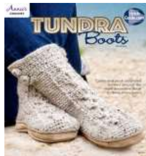
885201 Tundra Boots $13.50