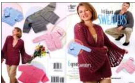
878533 Top Down Sweaters $15.95