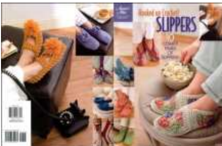
878542 Slippers Hooked of Crochet $17.20