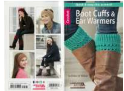
LA75472 Boot Cuffs & Ear Warmers $9.50