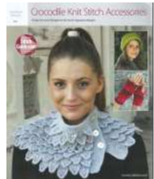
886040 Crocodile Knit Stitch Acc $20.50