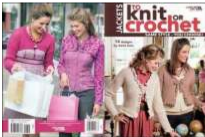
LA4088 Jackets to Knit or Crochet $37.20 ** Very Heavy Book