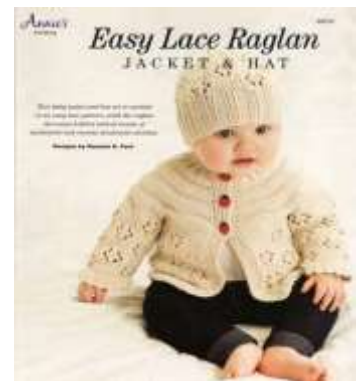
885147 Easy Lace Raglan Jackets & Hats (Knit) $8.95