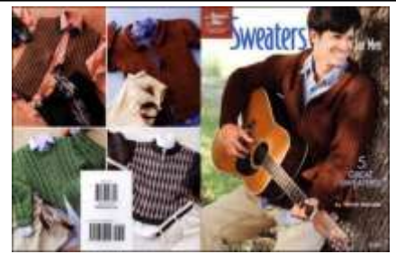
878541 Sweaters for Men $15.95