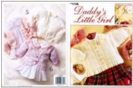
LA3332 Daddy's Little Girl (Knit) $16.20