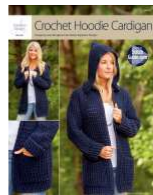
886014 Crochet Hoodie Cardigan $15.20