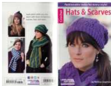
LA75431 Hats & Scarves $8.95