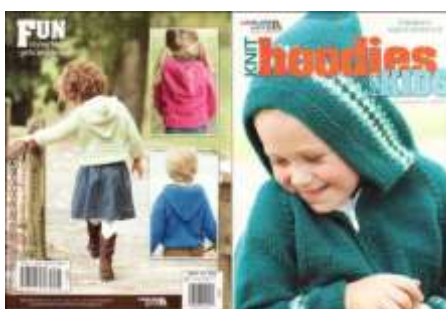
LA4453 Knit Hoodies for Kids $13.95