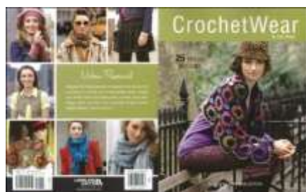
LA4799 Crochet Wear $48.20 ** Very Heavy Book