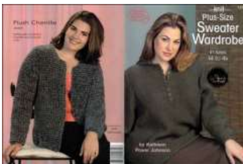
ASN1314 Plus Size Sweater Wardrobe (Knit) $30.70