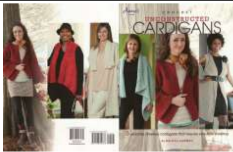
871238 Crochet Unconstructed Cardigans $14.20