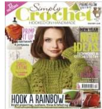
SC40 Simply Crochet Issue 40 $20.25