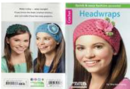
LA75430 Headwraps $9.50