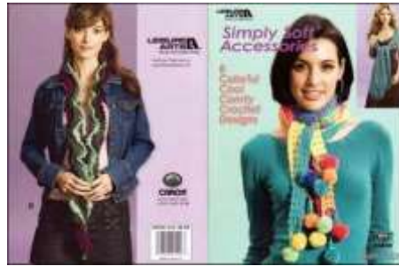
LA4556 Simply Soft Accessories $15.30