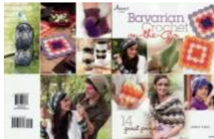
871375 Bavarian Crochet on the Go $16.50