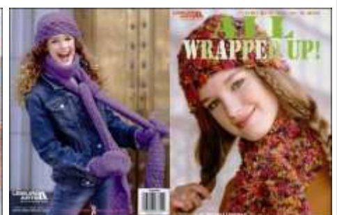
LA3744 All Wrapped Up $16.50