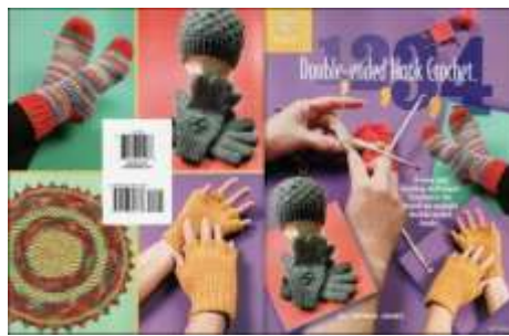
871063 1-2-3-4 Double-ended Hook Crochet $12.95