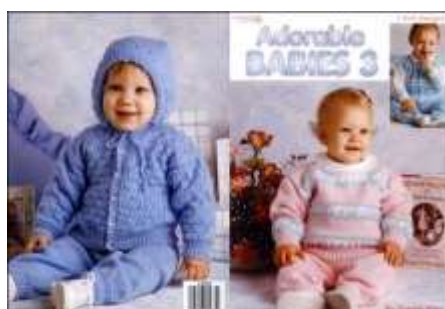
LA935 Adorable Babies 3 (Knit) $9.30