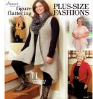
871387 Plus-size Fashions $19.50