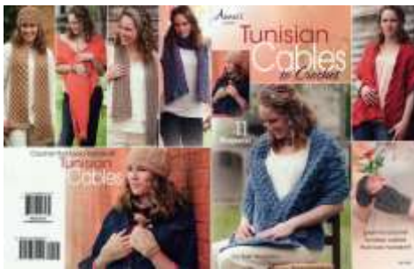
871221 Tunisian Cables to Crochet $16.25