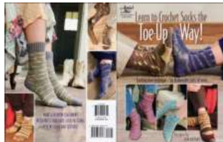
871061 Learn to Crochet Socks Toe-up Way $15.95