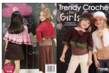
LA4656 Trendy Crochet for Girls $19.70