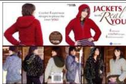
LA4261 Jackets for the Real You $19.60