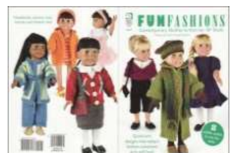
121067 Fun Fashions Knit for 18" Doll Outfits $15.20