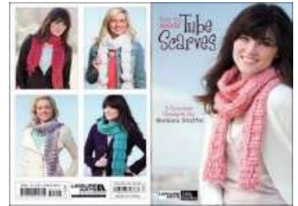
LA75378 Fun to Wear Tube Scarves $9.30