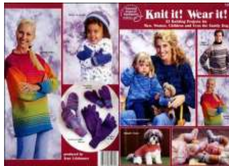
ASN1265 Knit it Wear It $36.75 * Heavy Book