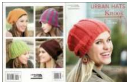
LA5781 Urban Hats made with the Knook $15.30