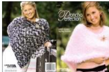
LA3976 Poncho Perfection (Knit) $12.00