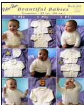
PP288 Beautiful Babies 2, 3 & 4 ply $21.95