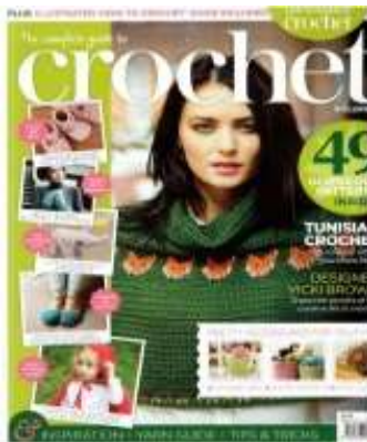
ICM003 Complete Guide to Crochet Vol 2 $26.50