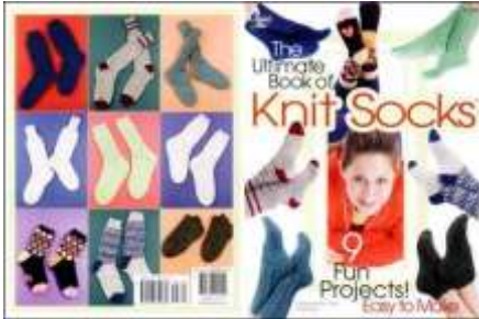
873692 The Ultimate Book of Knit Socks $14.30