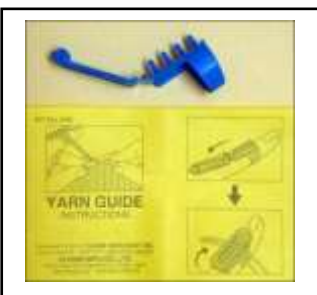
ACCYRNGUIDE To use when knitting with several yarns at once $6.50