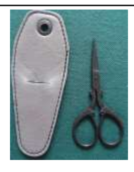
ACCTHRCUTSC $10.50 Precision Scissors & cover