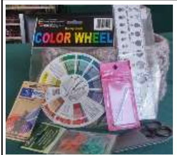
Crochet Accessories Kit Basic $38.00 KITCROACC Deluxe $150.00