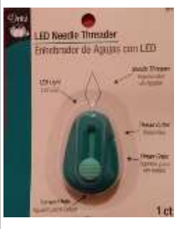
ACCNDLTHREADLED Needle Threader with led light $12.50