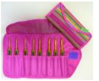
Clover Hook Set with Pouch$105.90