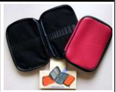
HOOKCASEDELUXE Birch Crochet Hook Case $10.95