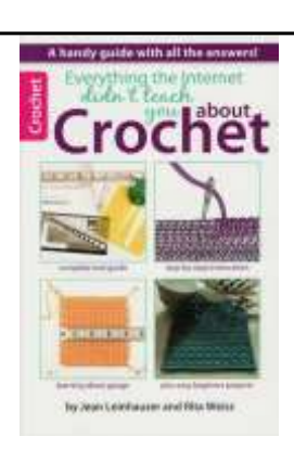
LA75434 $15.95 Everything about Crochet * Heavy