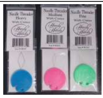
ACCTHREADCUTFINE $2.40 each. Threader & cutter