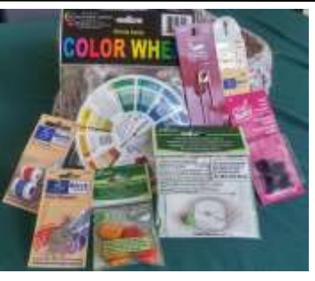
Knitting Accessory Kits Basic $38.00 KITKNITACC Deluxe $150.00