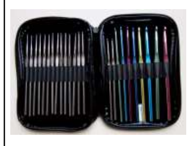
HOOKSETBIRCH 24 Pc Crochet HOOKSETCVARALGETAWAY Hook Set $32.00