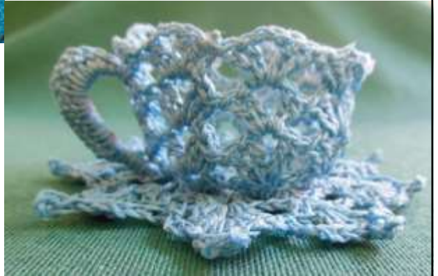
Susan L - Yandina QLD

I just wanted to say thank you for your excellent service 😊 I received my Soft Touch hook yesterday and I am very happy with it, it is very comfortable to use, so thank you for your advice. I will definitely check out your online store next time I need something.