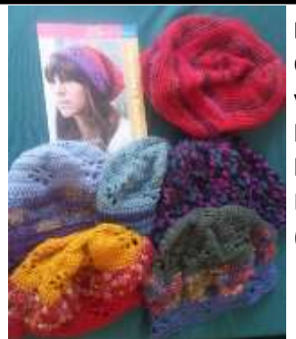
Dianna M , Brisbane QLD used up her yarn stash making beanies from the book Crocheted Beanies 20 to Make (SP0009)