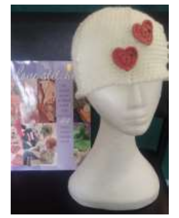
Sue L, Yandina QLD crocheted hats and adorned them with flowers – designs from the book Love Stitches (879537)