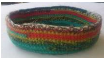
Gillian C, Nambour QLD made this basket from Loyal baby print 8 ply wool. She used a mixture of glue and water to stiffen it.