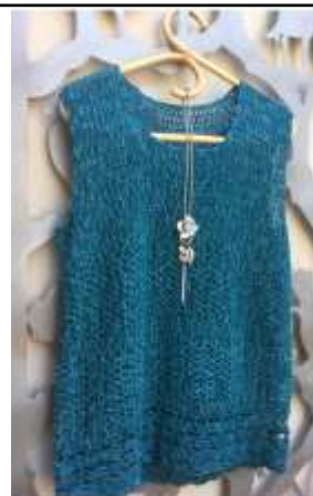
Maureen I, Sunshine Coast QLD used Scheepjes sunkissed 4 ply cotton to crochet this summer top. She also knitted and crocheted these socks using Boho Sock Yarn.