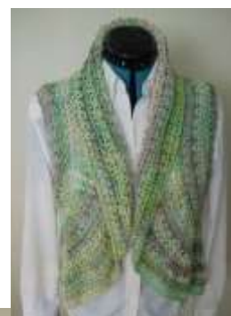
Chris G, Summerland Point NSW crocheted these cross over vests from the book 871229 Fashions to Flaunt in Camilla Batik 5 ply cotton.