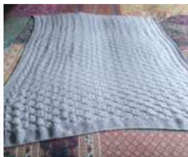
Lyn G, Kawarau Falls, NZ Knitted baby blanket with Heirloom 8 ply cotton 8 ply. Beautiful to knit with.