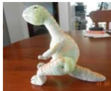
Barbara B, Sunshine Coast QLD used Camilla Batik 5 ply cotton to crochet this cute dinosaur.