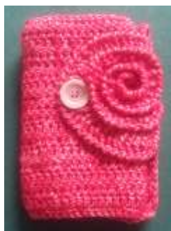
Shirley Simmons, Sunshine Coast QLD

Using Scheepjes Stonewash cotton/ acrylic blend made this crochet hook holder during our April workshop