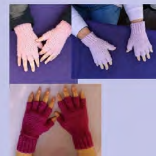
Gloves made at our July workshop, using Merino Soft