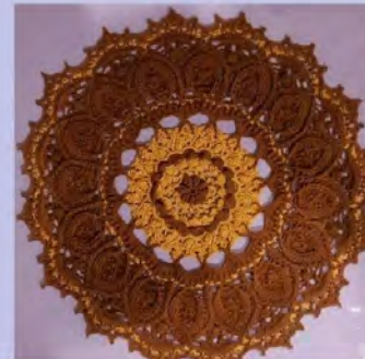
Doily made with Babylo cotton thread