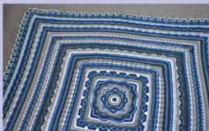
Blanket made with Catona cotton. It kept me busy when we were staying home due to the Corona virus. I found that cotton really nice to work with. The pattern is from Ravelry.