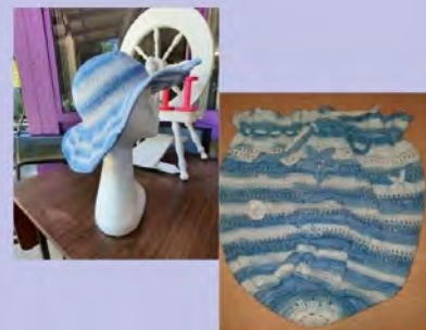
Used Camilla Batik to make this summer hat and beach bag