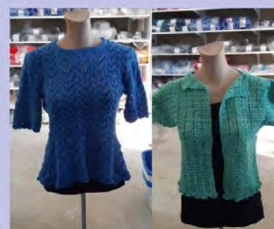
Summer tops - one knitted, one crocheted with Catona Denim