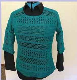
Long sleeve top made with Scheepjes Bamboo Soft - bamboo/cotton yarn