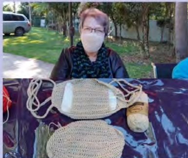
Face Masks with pockets for replacing lining made with Catona cotton