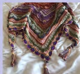
Lost in time Shawl made with Sheepjes Catona cotton