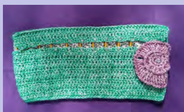
Amonite Hook holder made with Scheepjes Stone Washed cotton/acrylic yarn