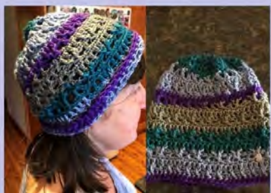
Beanie made with Fiddlesticks Superb 88 acrylic yarn