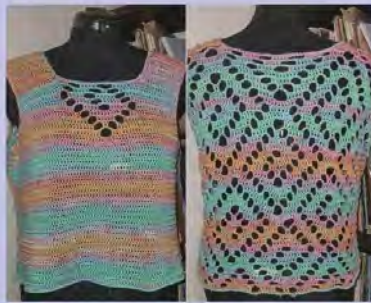
Front and back