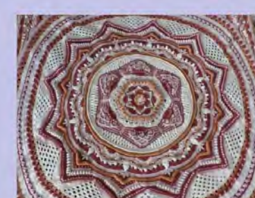
Mandala with Superb 8 acrylic yarn