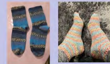
Socks made with Boho Sock yarn (blue) and other sock yarn (right)