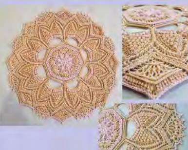
Table centre made with Babylo cotton thread.