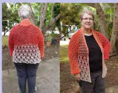
Jenny King Designs Sharon CAL made with a Whirl