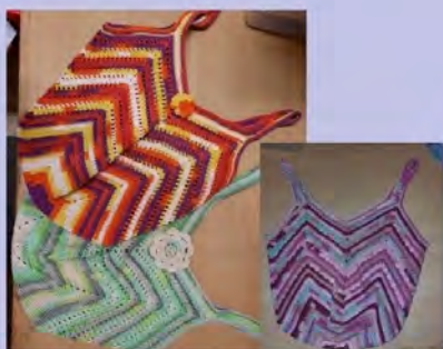
Fran's Bag made with Camilla Batik cotton. Sue embellished hers with flowers.