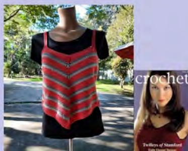
Summer top made with Fiddlesticks Cedar bamboo/cotton. Pattern from the book Crochet Fashion