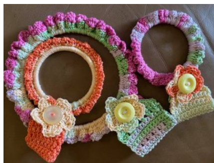
Towel in a ring - pattern by Vicki moodie, made from Camilla Batik Cotton