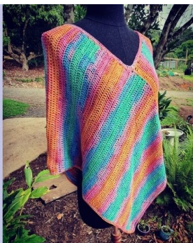
Poncho crocheted with camilla batik