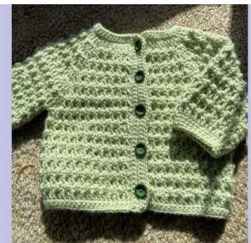
Baby jacket made with Stonewash 8 ply cotton/acrylic.