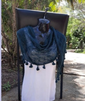
Knitted Scarf adapted from the Batwing Shrug pattern made with Risoni silk 4 ply

Thank you everyone for sending in pictures of what you have been making in the past quarter. We feature below some comments and masterpieces submitted by customers. Send us a photo of your masterpiece (by email or on our facebook page— www.facebook.com/crochetaustralia ), telling us which book it came from and which yarn or thread you used, and be in the draw to win a $25 voucher in April 2021 (see conditions on our website). Please also add any tips you've picked up when making them. Congratulations to Yvonne B for sending in her photo of the Knitted Scarf in Risoni Silk and winning this quarter's voucher.