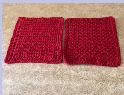
Facewashers with Finch 10 ply cotton made from the book "50 Tunisian Stitches to make face washers"