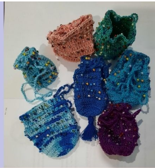
Beaded purses made with Create Handmade Cotton