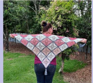
Fortitude Shawl made with Cedar bamboo/cotton