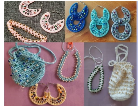
Beaded earrings in Lizbeth #10 thread, beaded bags and Turkish beaded bracelets with create handmade