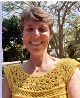
Summer top made from Almina cotton