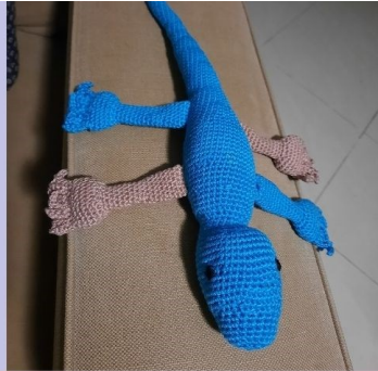
Gecko made with Catona cotton - pattern from Simply Crochet Magazine