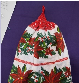
Took the skills she gained in our beading workshop to crochet a beaded towel top