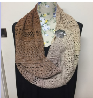
Portabello scarf made from a Scheepjes whirl