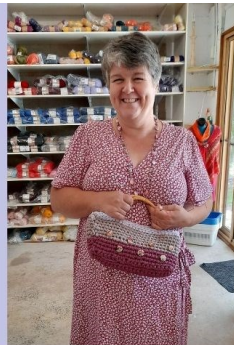
Crocheted this handy bag with Lanka t-shirt yarn