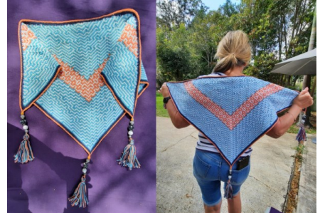
Mosaic Triangular Shawl Made from Cedar bamboo/cotton