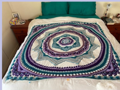
Blanket made in Superb 8 Acrylic yarn