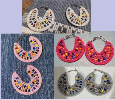
Beaded earrings using Lizbeth #10 thread