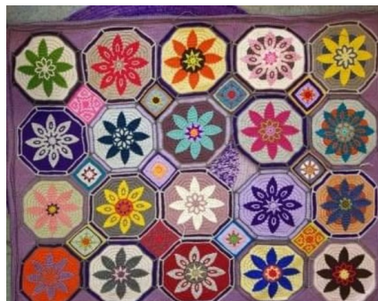
Persian tiles blanket made from all 69 colours of Superb 8