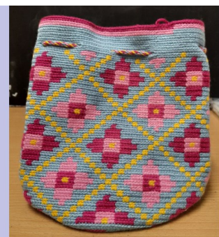
Mochilla bag from the book Colourful Wayu Bags to Crochet. Made using Superb 8