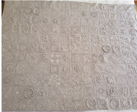
Blanket from Granny Square Flair book using Papyrus cotton/silk - 154 squares

Thank you everyone for sending in pictures of what you have been making in the past quarter. We feature below some comments and masterpieces submitted by customers. Send us a photo of your masterpiece (by email, via the Gallery on our website or on our facebook page, telling us which book it came from and which yarn or thread you used, and be in the draw to win a $25 voucher in October 2021 (see conditions on our website). Please also add any tips you've picked up when making them. Congratulations to Geraldine Low for winning this quarter's voucher, sending in a photo of her mosaic scarf.