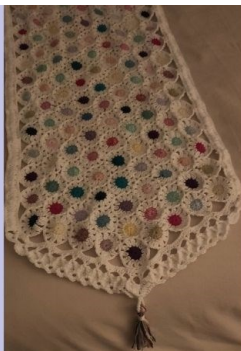
Wrap/bed scarf with Catona cotton. Started as a stash buster but developed a mind of its own...