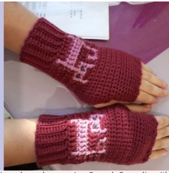
Fingerless gloves using Superb 8 acrylic with the base pattern from our glove kit. Mosaic design added after completing the mosaic workshop