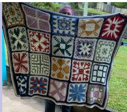
Waterfall crochet granny square blanket made with Finch cotton JENNY H