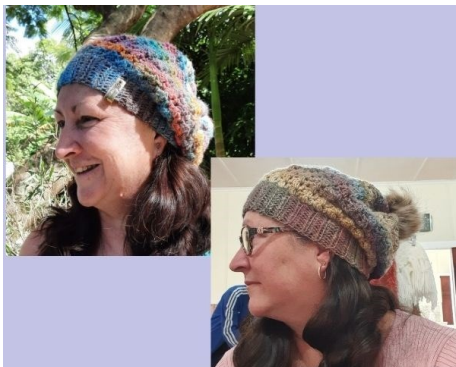
Slouchy beanies with Sierra wool/acrylic