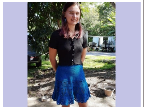
The Queensland skirt from Drops made in Catona cotton