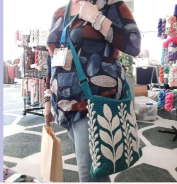
Spica Bag began at the retreat 2020. It was great to see it being used at the CGA conference