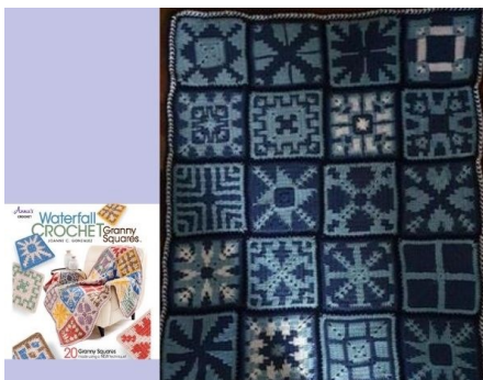
Blanket made from Waterfall Crochet Granny Squares book. Made using Superb 8 acrylic