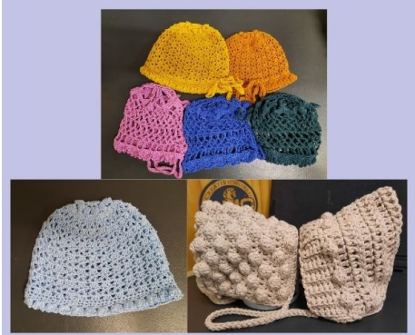
Baby bonnets made with Catona cotton