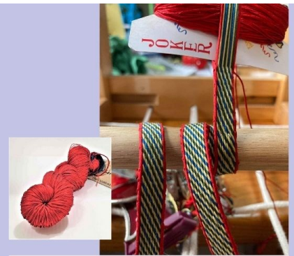
Woven straps in mulberry silk to be worn at the Abbey Medieval Festival