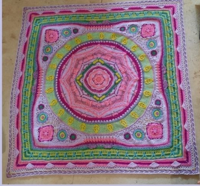
D'Histoire Naturelle Scheepjes 2020 CAL