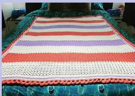
Blanket made with Superb 8 - Stripes in three colours using the V stitch SHARON M