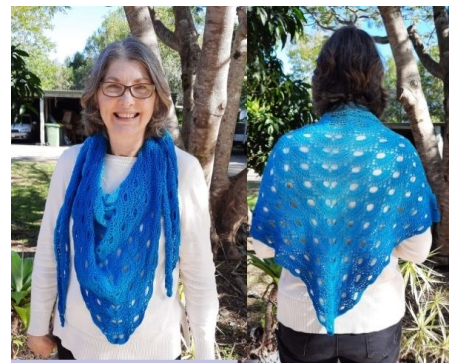
Virus Shawl scarf made with a Whirl LYNN A