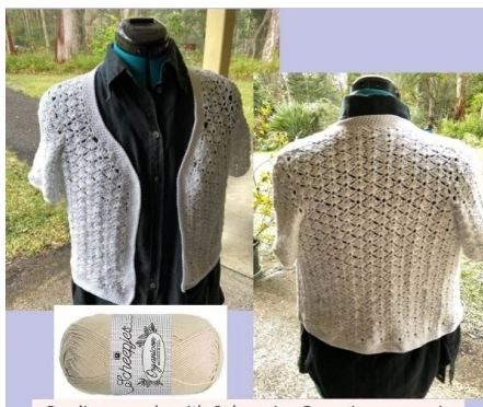
Cardigan made with Scheepjes Organicon organic cotton - pattern from Crochet! magazine Spring 2015 CHRIS G