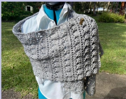
Wrap crocheted in Scheepjes Stone Washed cotton/acrylic - her own design CHRIS G