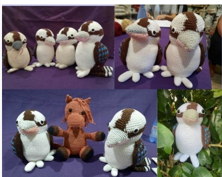
A flock of kookaburras in Catona cotton and a horse in Finch cotton