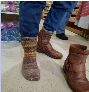
Socks made with Boho sock yarn - started at our sock workshop 2020, ready in time for winter