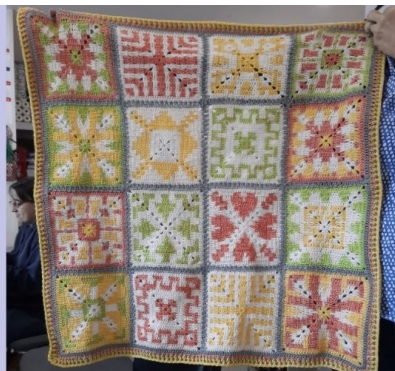
Waterfall crochet granny square blanket made in acrylic