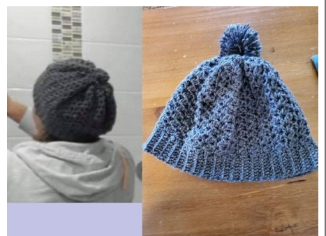
Slouchy beanie with Superb Tweed acrylic - Beanie Kit