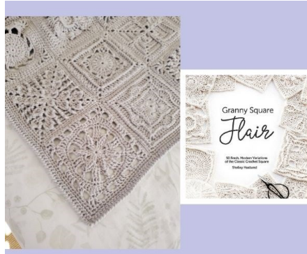
Blanket from Granny Square Flair book using Papyrus cotton/silk - 154 squares