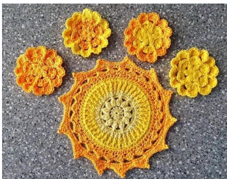
Motifs and flowers done in Catona cotton for the CGA 'Let the Sunshine In' Installation