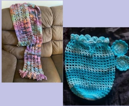
Scarf in sierra, and bag & scrubbies using Camilla Batik cotton DEB H