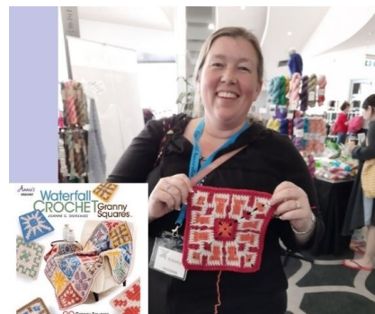
I led a workshop at the Crochet Guild Conference learning the Waterfall Technique. One of the finished squares.