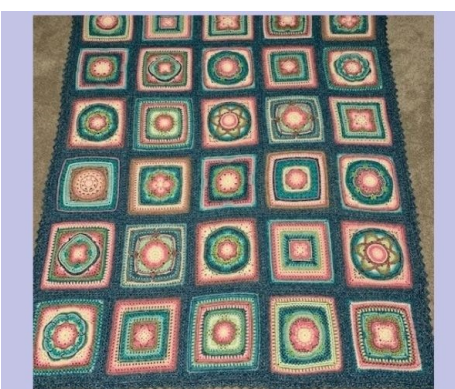
"Hooked on Sunshine Granny Squares" blanket made with stonewash ESMEE M