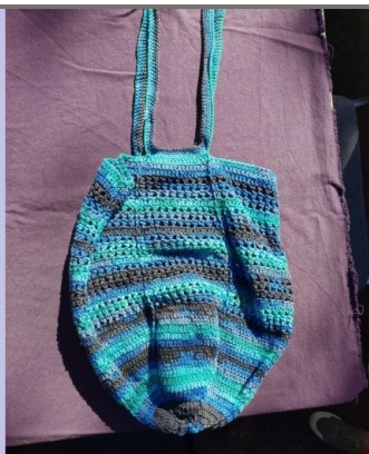
Keep it together Tote made with Camilla batik DEARNE G