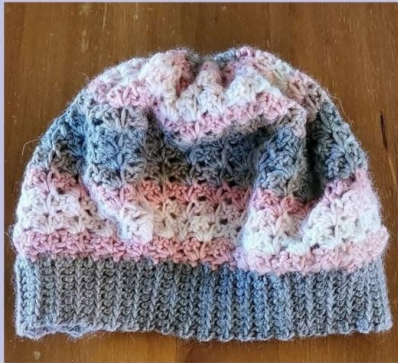
Beanie from our beanie kit made with Superb 8 MICHELLE H