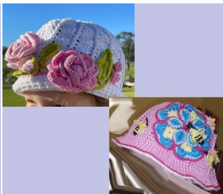
Child's hats done in Catona cotton MAGGIE P