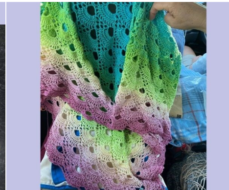
Virus Shawl in a Whirl DEB H