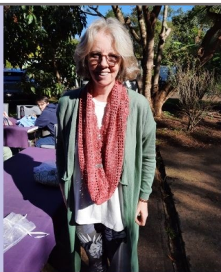
Wrap from Homespun edition 1 made in Sunkissed cotton MARJORY E