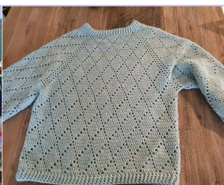
Knitted jumper with Scheepjes Stone wash ROZ M