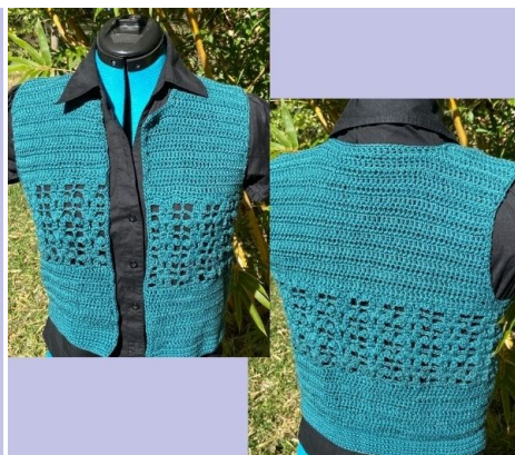
Vest made with Catona cotton