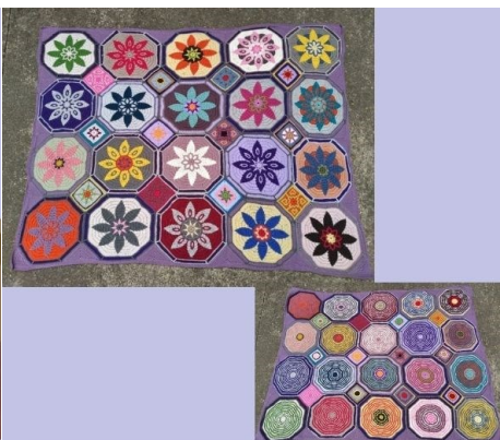
Fiesta blanket done in Superb 8 Front & Back - all 69 colours used PURPLE B