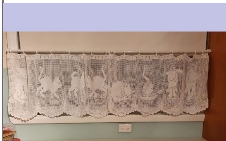
DMC Babylo #20 Lace Curtain SONYA K