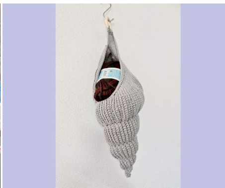
Shell basket made using Finch cotton - same designer as the one completed at the retreat LOZ J