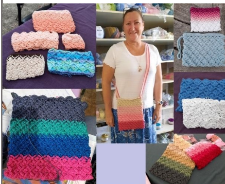
Many fell in love with the bavarian stitch and couldn't stop at 1 - using finch and catona cotton - purses of all colour combinations SEPTEMBER WORKSHOP

'Hi, just a short note to thank you for my order. It was received in good condition and promptly. Kind regards' Mary