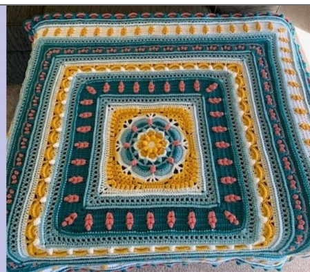
Blanket made with Catona Cotton ESMEE M