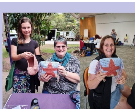
Retreat 2021 projects complete