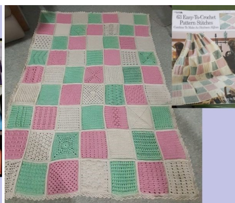
Blanket made from the book '63 Easy-To-Crochet Pattern Stitches' SUE Z