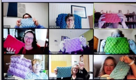
Monday night's workshop - purses completed - zip in and straps done SEPTEMBER WORKSHOP