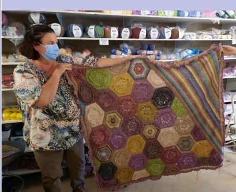
The "Dutch rose" blanket made with stonewash JANINE S