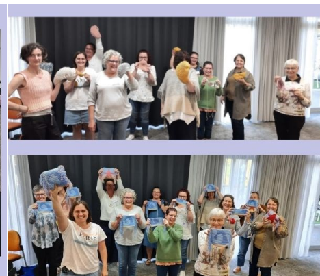
Retreat 2021 projects - some complete - most not far off