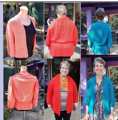
Pleated cardigan from May and July workshops