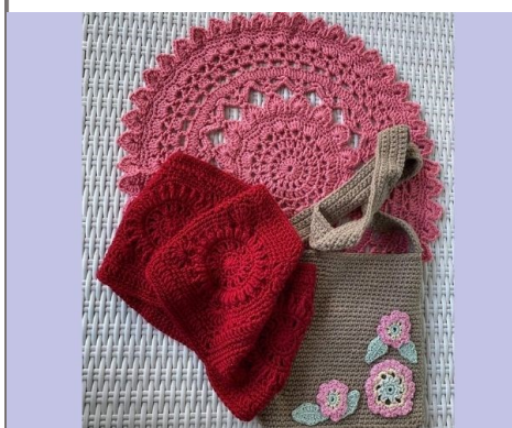
Crochet Tournament 2021 projects DEB H