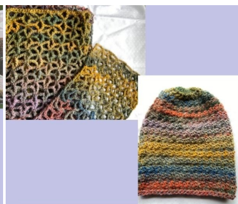
Beanie from "Necks & Noggins", scarf from "The Loopy Stitch" made with Sierra wool/acrylic yarn