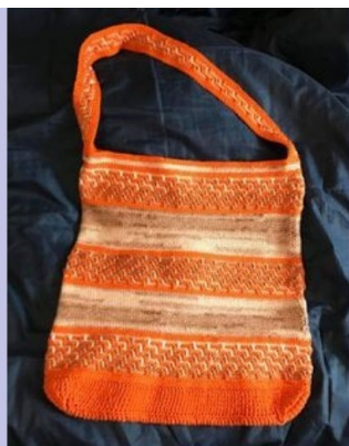
Mosaic bag in Catona cotton NETTY R