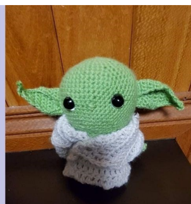
Yoda crocheted with Superb 8 - Pattern from the internet MICHAEL W