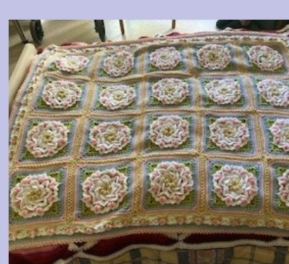
Blanket made with Superb 8 LORRAINE S