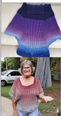
Using Whirls CALIN TOP AUGUST WORKSHOP