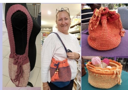
One of September's project was tunisian in the round - many ladies adapted the finish and the look using two colours. SEPTEMBER WORKSHOP