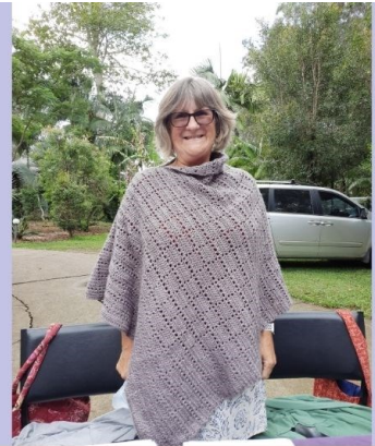
Poncho in Superb 8 DEARNE G