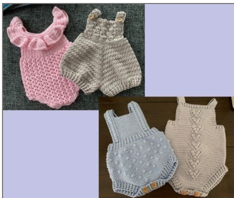
Adorable baby sets made with the last of our Heirloom Cotton ESMEE M