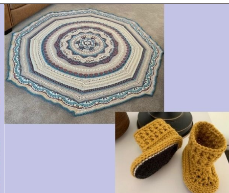
"Octagonal" blanket by H Shrimpton and booties made with superb 8 ESMEE M