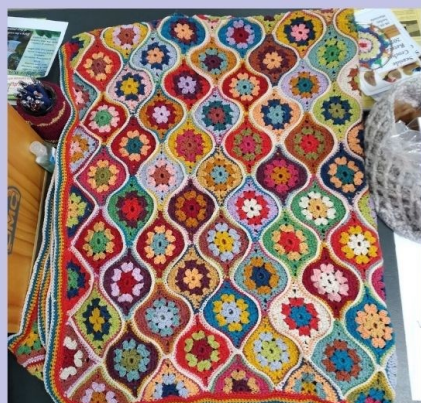
Blanket from tear drops using Catona cotton JUDITH M