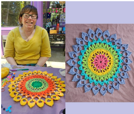
Mandalas made with Finch and pony beads from the book Making Mandalas MANDALA CLASS