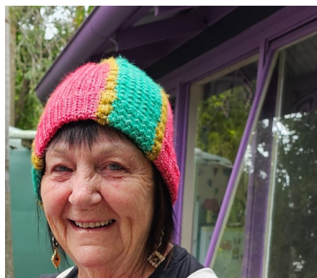
Stellar Beanie in Stonewashed FRANCES D