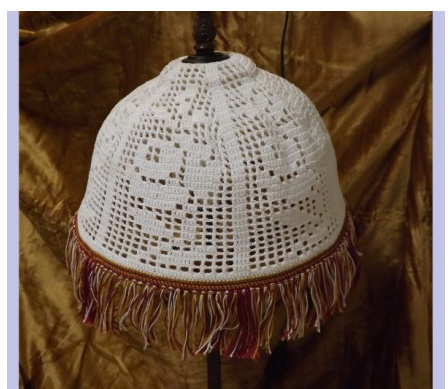
Lampshade with Babylo #5, vintage pattern SUE T