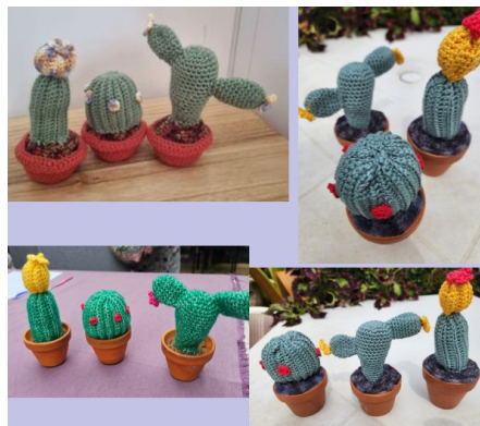
Cactus Plants - made with Stonewashed or Catona cotton MARCH CLASS