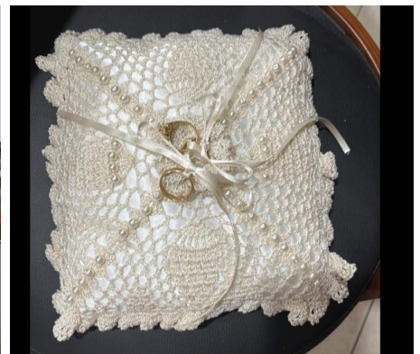
Ring Bearer Pillow made with MT Maxi Metallic #10 Thread DONNA M