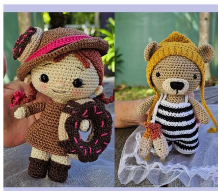
Dolls made with Catona cotton LEANNE S