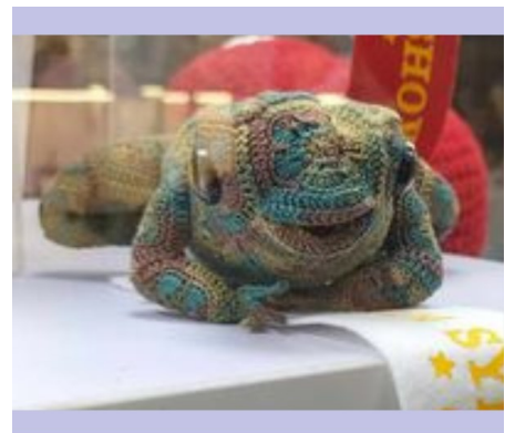
Frog made with Lizbeth #20 Thread LEAH W