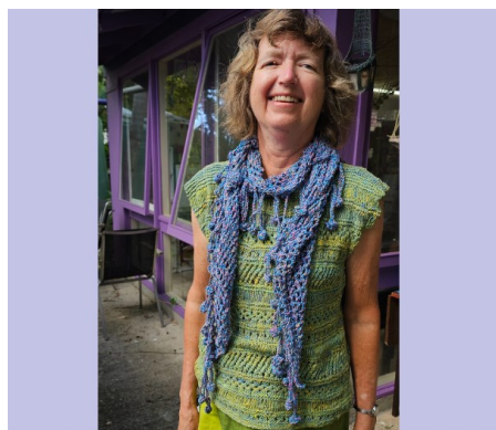
Bobble Scarf with Flora Cotton Tweed CHRIS E