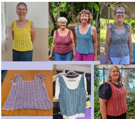
Tassel Tie Vest - made with organicon, cedar and Flora Cotton Tweed FEBRUARY CLASS