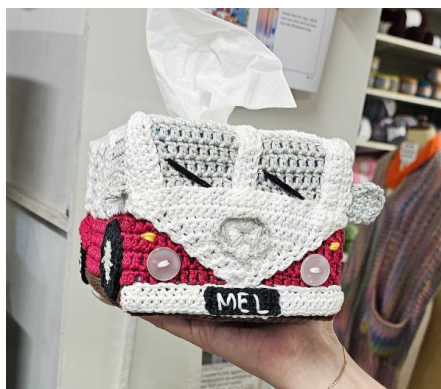
Kombi Tissue Box Cover - catona cotton MELISSA W