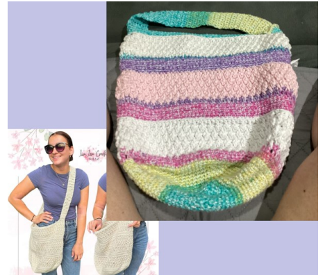
Shazzele Bag made with Finch & Royal Wave Cotton TRACEY O