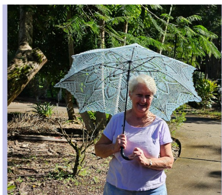
Parasol made with MT Maxi Metallic #10 Thread GERALDINE L