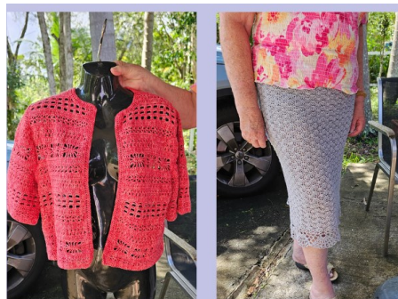
Lace jacket in Sunkissed cotton and skirt made with catona cotton JOAN P