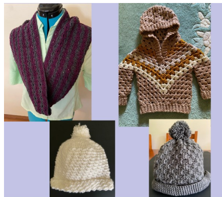
Coastal Celebrations Cowl in Bamboo Soft, Hoodie & Beanies in Superb 8 CHRIS G